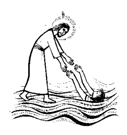
Take heart, it is 1; do not be afraid